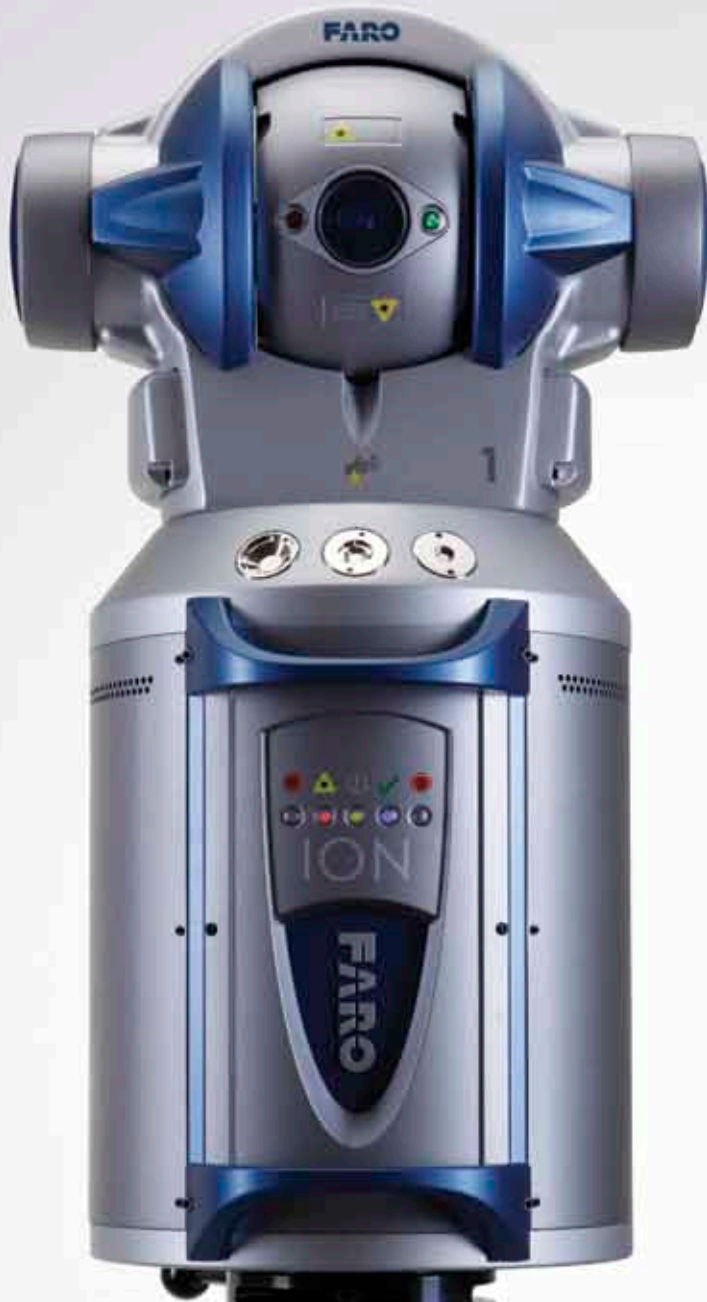
FARO Laser Tracker ION™